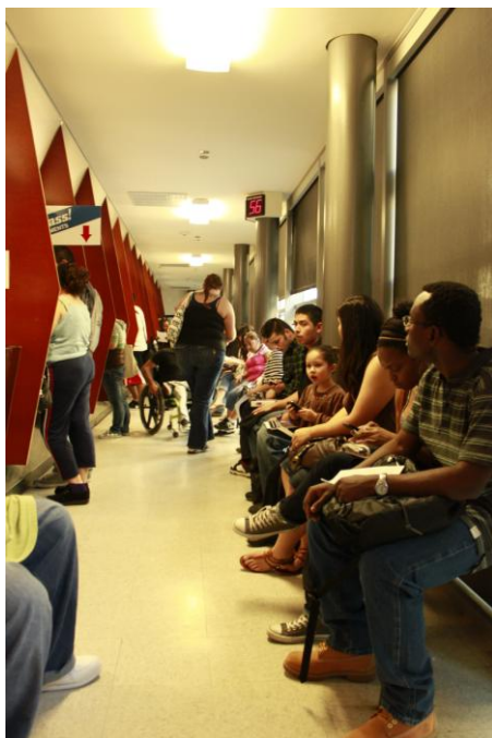
(Above) The Admissions/Records office is packed with students during the first week of classes for the spring 2011 semester.

The Office of Student Life organized three different "Week of Welcome" (WOW) booths around the campus to help disseminate information to students with questions.