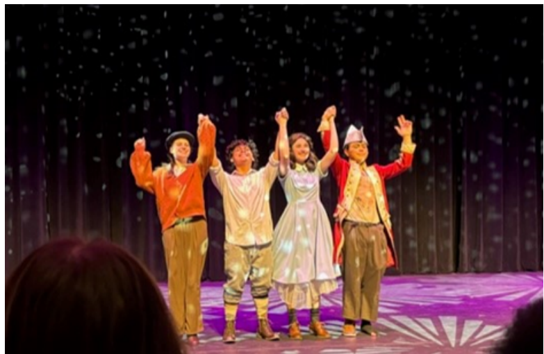
Students performing at Kennedy Center American College Theatre Festival.

Beyond the classroom, the Arts & Humanities Division plays a critical role in supporting and preparing students for their academic success. Student support is provided through the Writing Center and embedded tutoring, with extended hours and online options available to support all student populations. The Arts & Humanities Division also plays a critical role in preparing students for their future careers. One example of this is through our participation in the Pathways to Success Grant.