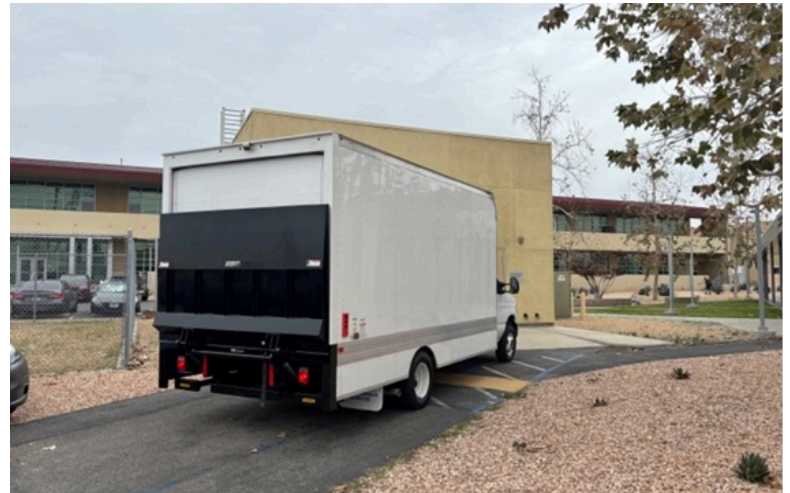
The newest member of the FTVM equipment family, a Grip Truck for state of the art, hands on, workforce relative lab experiences for students.