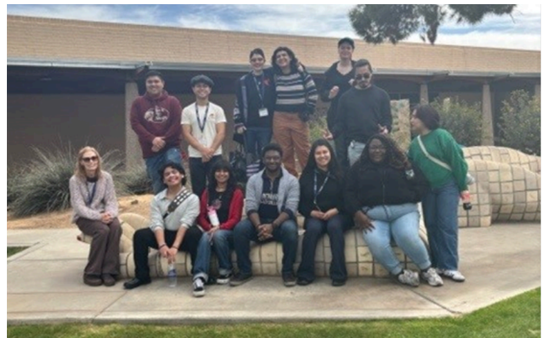
The Theatre Arts team ready to leave for Kennedy Center American College Theatre Festival in Arizona.