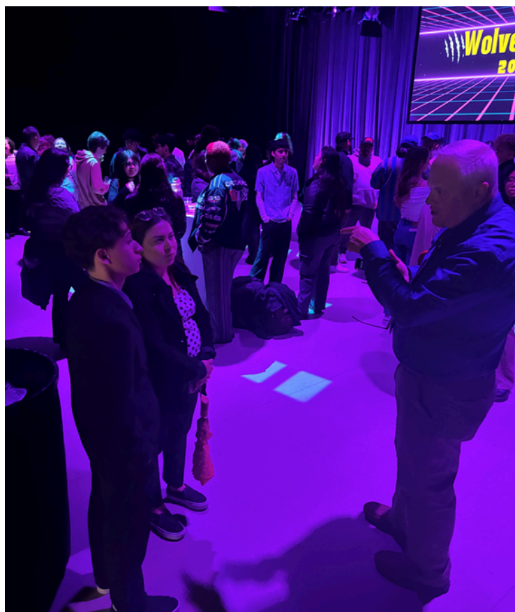
Students networking and connecting at Meet the Pros event as part of Wolverine Con.

Leading this dynamic, creative, and hard-working division is a privilege and an honor. The brilliance and talent of our faculty and staff make the work of leadership both rewarding and inspiring. Their evidence-based commitment to supporting students in both academic and real-world experiences, along with their genuine care for one another, strengthens our division and enhances the impact we have on our students' lives. Together, we continue to innovate, inspire, and create transformative educational experiences through the power of the arts and humanities. As we like to say and share often, the Arts & Humanities is the best division on campus. I can affirm, they are pretty fantastic and I am honored to be part of the greatness.