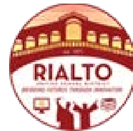
Rialto Adult Education Rialto Unified School District