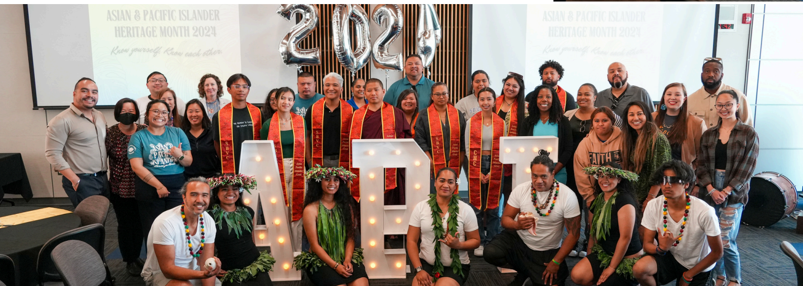
GOAL 2: BE A DIVERSE, EQUITABLE, INCLUSIVE, & ANTI-RACIST INSTITUTION

JULY 2024 PRESIDENT'S BOARD OF TRUSTEES REPORT