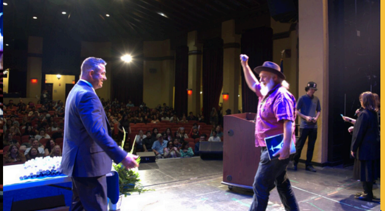
GOAL 1: ELIMINATE BARRIERS TO STUDENT ACCESS & SUCCESS.