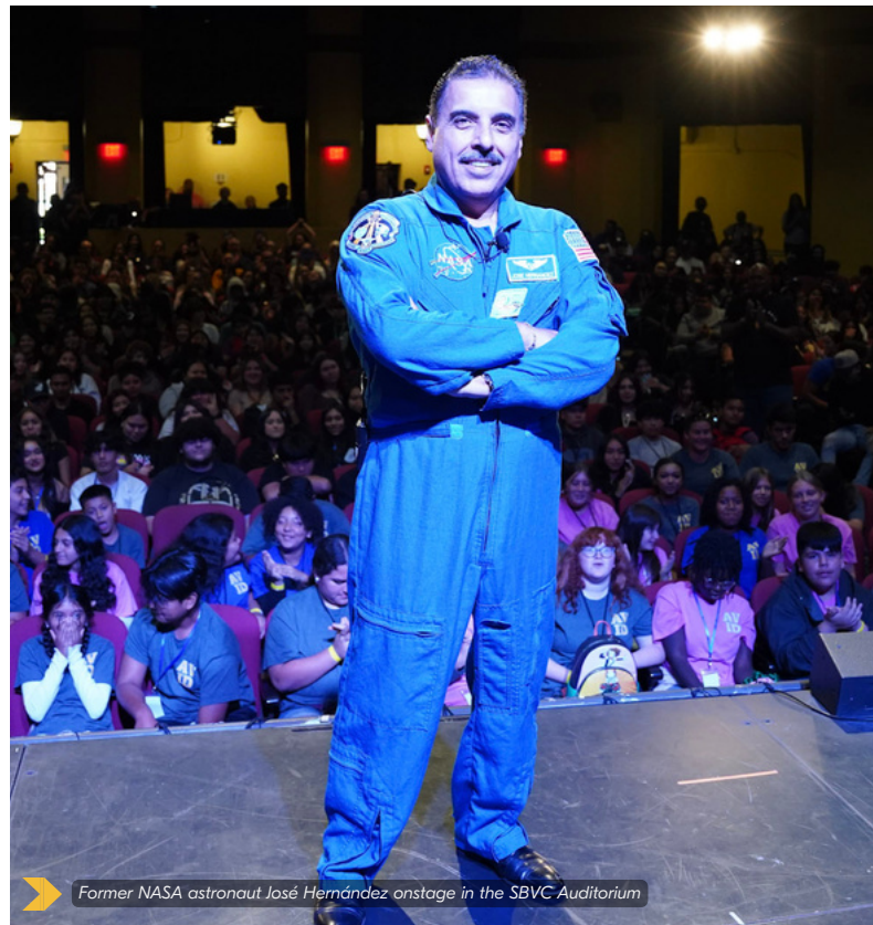
Former NASA astronaut José Hernández onstage in the SBVC Auditorium