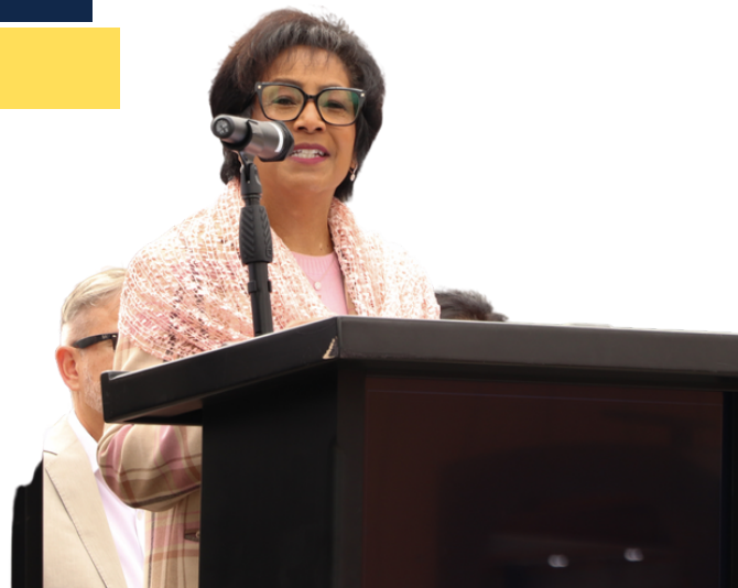
GOAL 3: BE A LEADER & PARTNER IN ADDRESSING REGIONAL ISSUES.