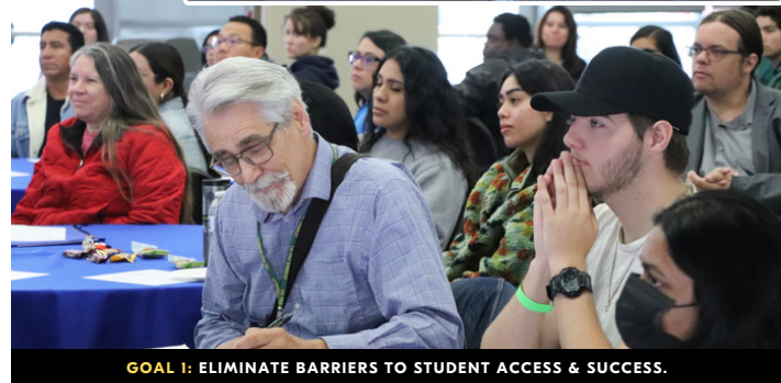
GOAL 1: ELIMINATE BARRIERS TO STUDENT ACCESS & SUCCESS.