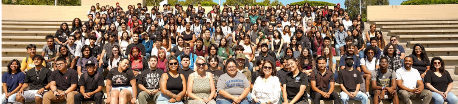
GOAL 1: ELIMINATE BARRIERS TO STUDENT ACCESS & SUCCESS.

Summer Bridge is one way for incoming Valley-Bound Commitment students to develop the skills necessary for a successful first year of college.