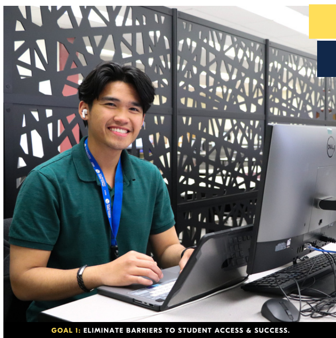
GOAL 1: ELIMINATE BARRIERS TO STUDENT ACCESS & SUCCESS.