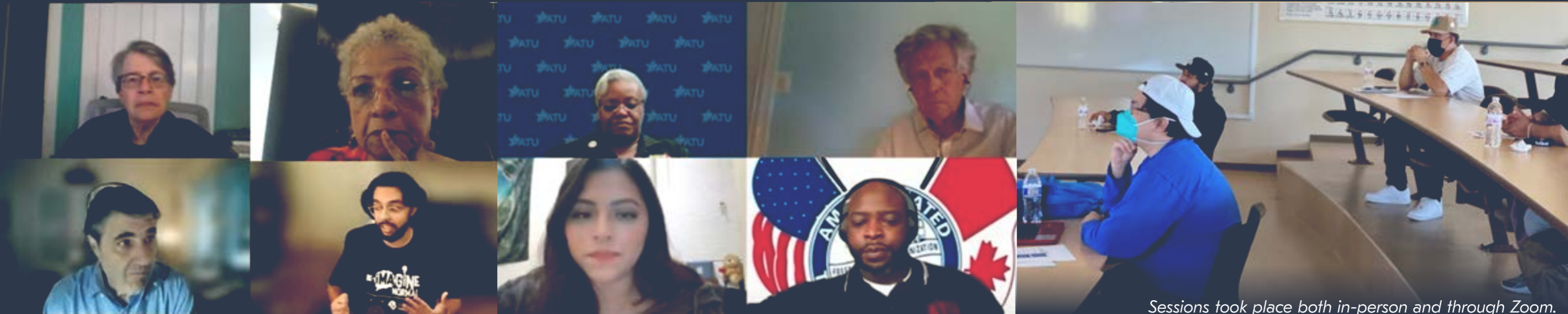
Sessions took place both in-person and through Zoom.