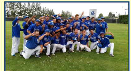
SBVC Baseball 2015 Foothill Conference Champs

SBVC Men's Baseball ended the 2014-2015 regular season as Foothill Conference champs. Tied with Rio Hondo going into the final three games of the season—all of them against the Roadrunners—things looked grim after the Wolverines dropped the first game, but then they came back for a two-game sweep with a dramatic extra-winning win in the final game of the season. Their first-round playoff opponent was Saddleback on May 1 st at home.