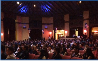
Dreamers Conference, April 17th.

On April 14 th FYE hosted a grand opening for the new “Dreamers Resource Center,” serving our AB540 students and the community. The