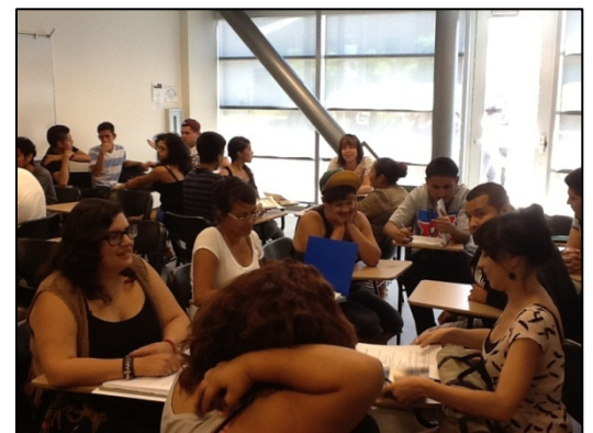
Students at work (and having fun!) within the Spanish 157/English 914 learning community.