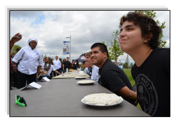
Club Wars on April 12<sup>th</sup> pitted numerous student clubs against each other in a variety of competitions, including a pie-eating contest. After the final scores were tallied, the Culinary Arts Club was declared the winner.