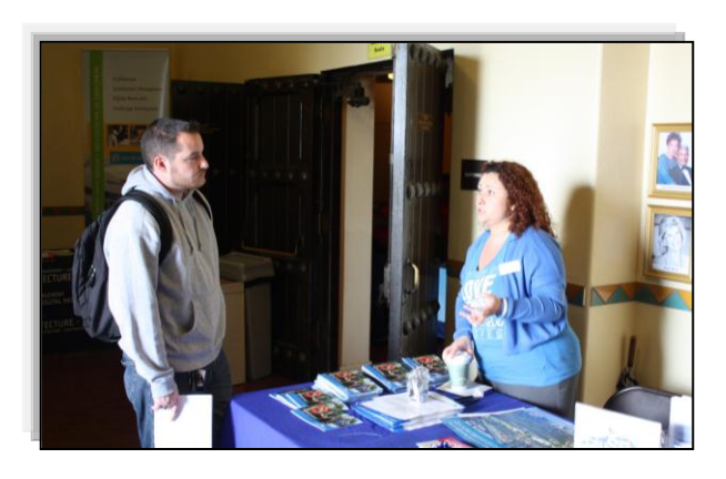
Dozens of four-year colleges and universities dodged the rainy weather by relocating to the SBVC Auditorium for the Spring Transfer Fair on April 11th.