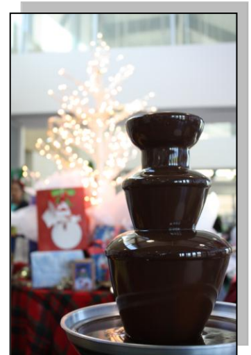
As part of their fall 2011 semester final, SBVC Culinary Arts served a variety of delectable desserts and appetizers.