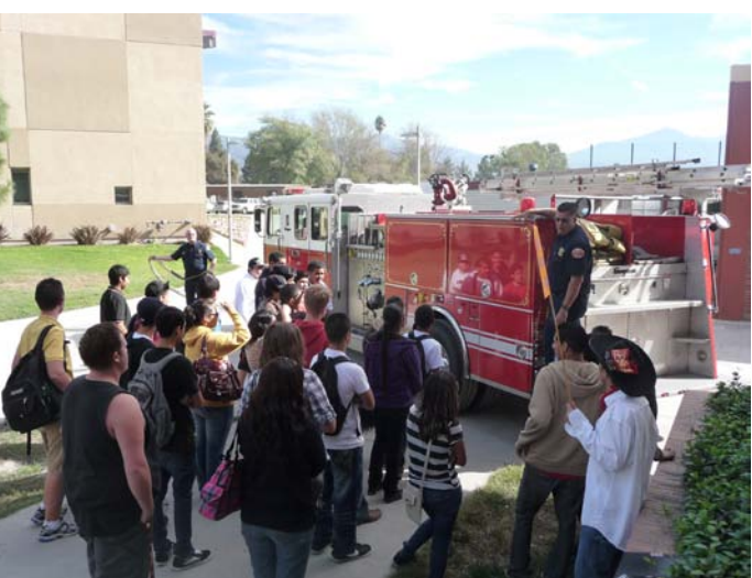
Breakout sessions included "Accident Investigation!," "Stop the Hacker!," "Dam Math!," "What's Algebra Got To Do With Firefighting?," (pictured above) and more.